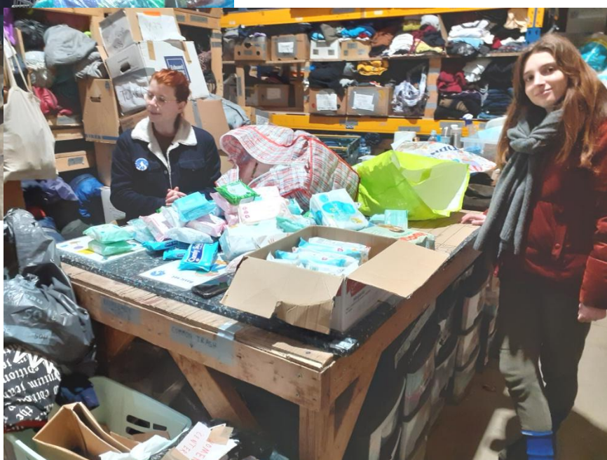
Your blankets and wipes are gratefully accepted by the volunteers.