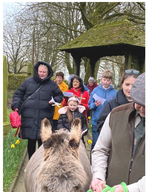
Gareth the donkey leads the procession through Bagnall village on Palm Sunday.