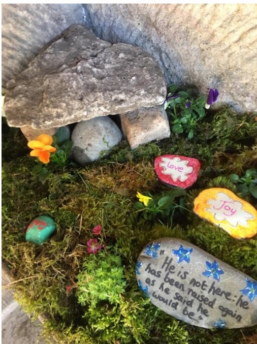
St Chad's beautiful Easter garden created in the church porch with helpers Florence and Judith.