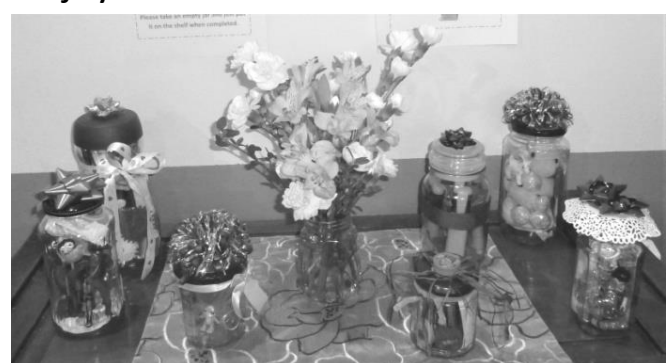
Just a few jars on show.

As I've said before, this year I'm running a jar tombola, jars filled with an absolutely amazing variety of gifts (it's remarkable just what you can get in a jar!) Each ticket costs just one pound and every one is a winner. Win cosmetics, stationery, soft toys, you name it and we've got it! I would really like to thank everyone who has contributed. I hope they've all enjoyed it as much as me. We now have 75 filled jars with the promise of